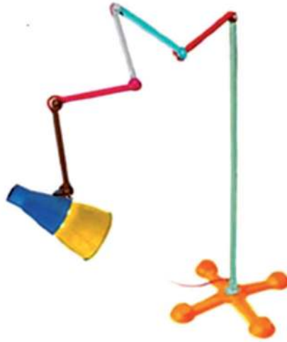
Figure 3: Armlite floor lamp