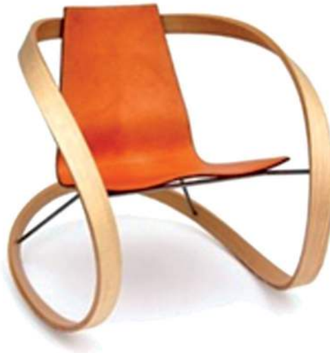
Figure 4: Ribbon Rocking Chair