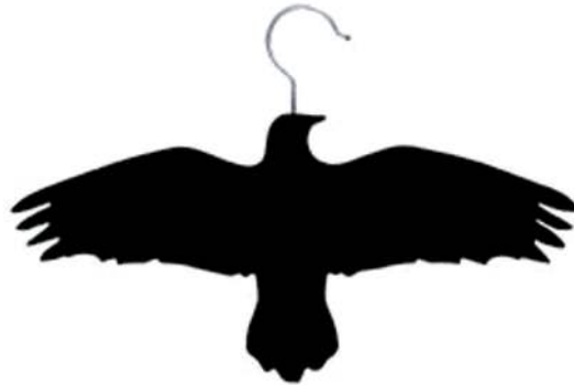
Figure 1: The Raven