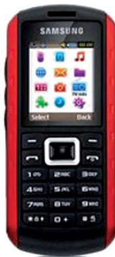
Figure 2: Solid Extreme